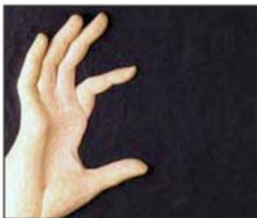
Figure Study #8

Paul Reiber has been working on a series of small relief panels. "These started as quick explorations combining texture and color. I was curious about the possibilities of adding color to my surfaces and then carving through that color to emphasize the texture. I could then add another layer of color and carve down through that color, achieving multiply colors and textures. For subject matter I choose local birds: Ravens and Owls, then on to chickens. At the height of the summer harvest season I did tomatoes and peppers. The most recent in these panels are figure studies done in uncolored wood against a black lacquer background, simplifying the use of color to a bold black and white